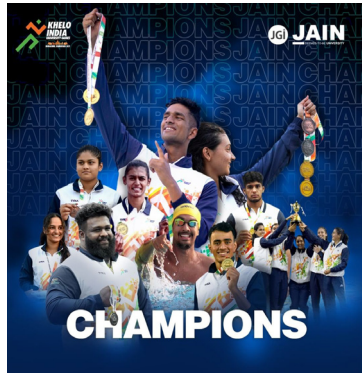
KIGU 2021 Closing Ceremony JAIN University campions of KIUG Page 11