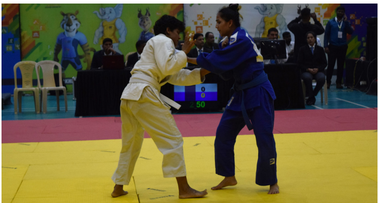
Women's Judo