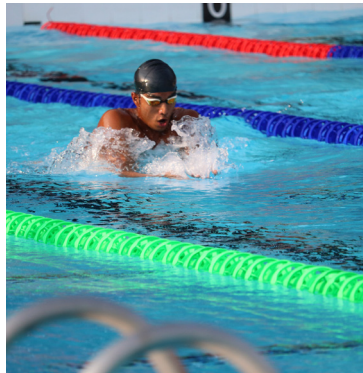
Swimming Competition Khelo India University Games 2021 Page 4