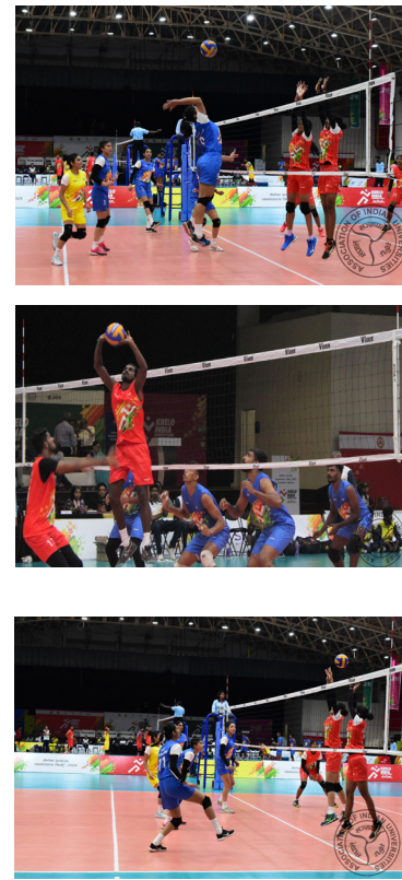
Glimpse of Volleyball event

Girls from HPS and PUC appeared equally powerful as they warmed up before the round began. HPS led in the first half, but Chandigarh grabbed control after a planned stoppage. However, stupid mistakes caused the team to lose the round, resulting in HPS winning the round with a score of 25-18. On the other hand, as the men's game was going on, Kurukshetra University in Haryana defeated Adamas University in West Bengal by a score of 25-22, which is pretty commendable.