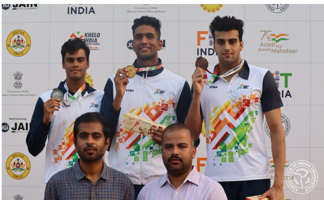
Women's Swimming Championship