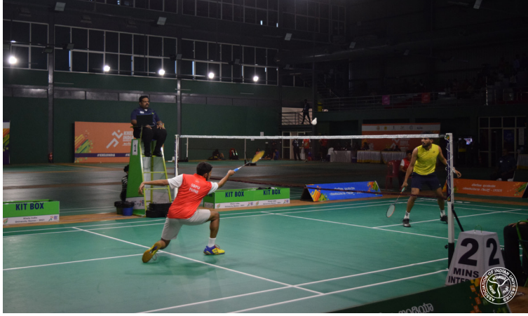
Men's Badminton Singles (Semi-Finals)