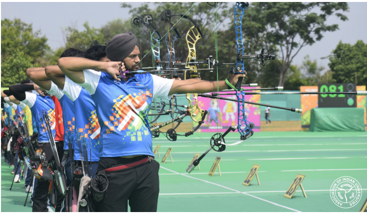
Men's Archery