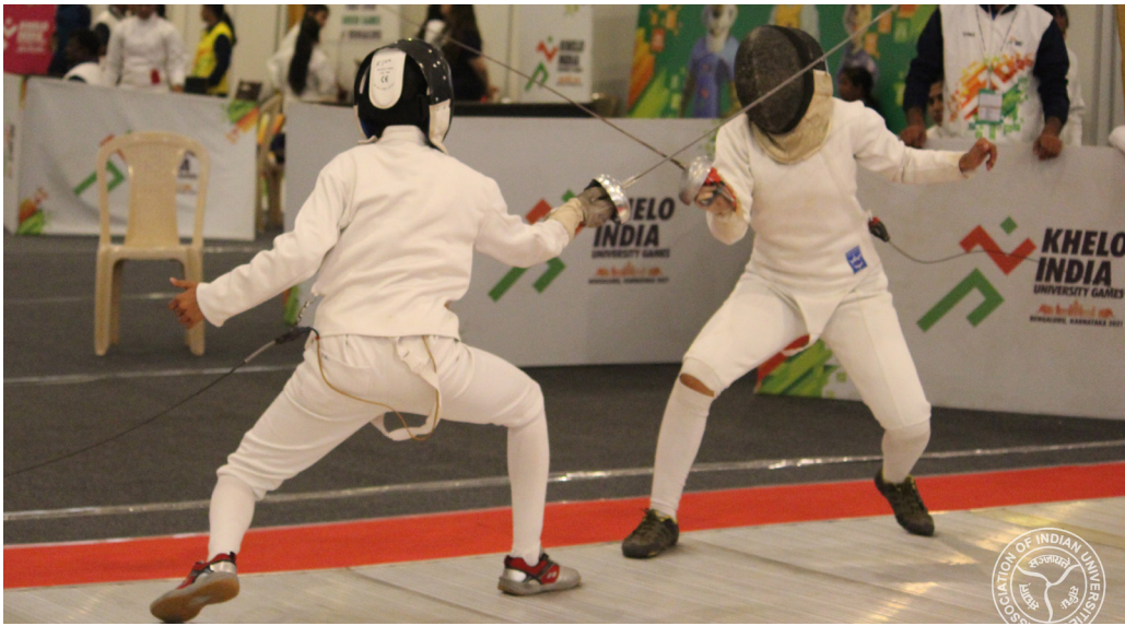
Fencing Finals