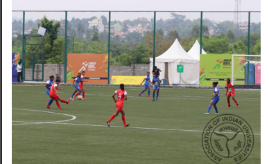
Women's Football KIUG 2021

On April 24th, 2022, the Khelo India University Games began. Football group stage group B was one of the games played for girls at "The sports school" of Jain university. It began at 9:00 a.m. and ended at 11:00 a.m. Each squad has ten players including one goalkeeper. The match was between Dev Nanak University (Punjab) and Utkal University (Odisha). For the first 30 minutes, neither team scored a goal, with Punjab trying 5 times and Odisha trying twice. Dev Nanak scored two goals in a short amount of time later in the second half. The second time, Utkal University scored one goal while leading the match, although they attempted for goals but the keepers were strong enough to prevent them. Dev Nanak University eventually won the game by a large margin.