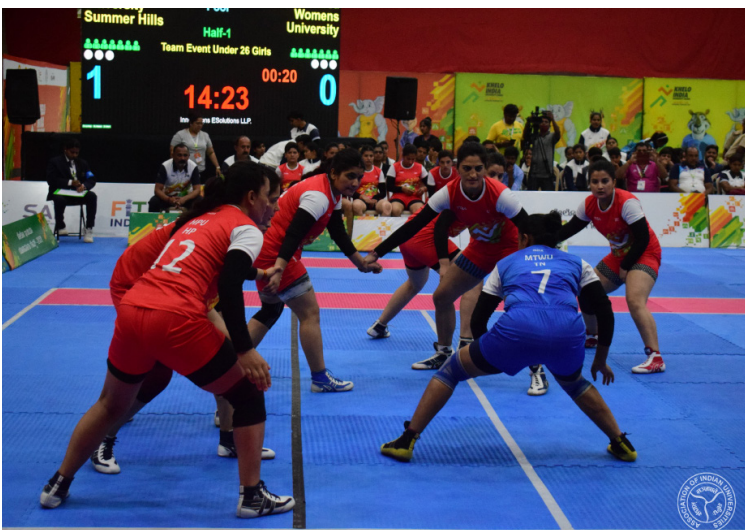
Women's Kabaddi