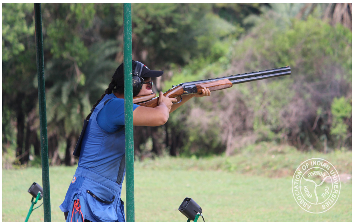
Women’s Shooting Indoor KIUG 2021