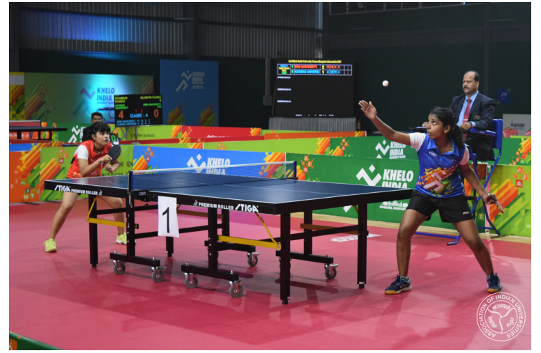
Women's Table Tennis