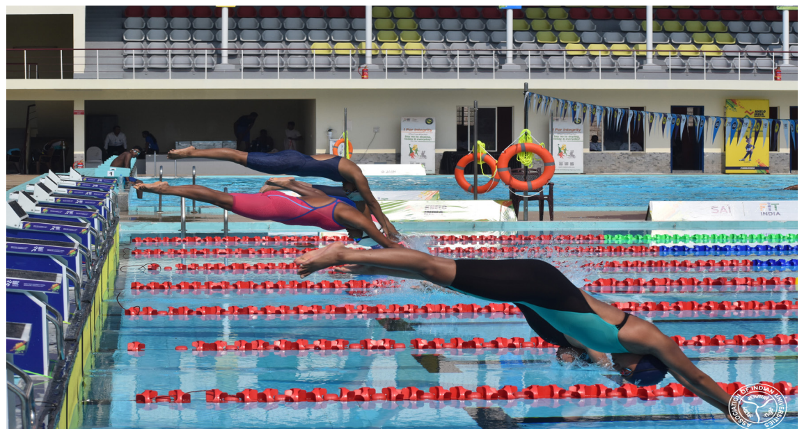
Swimming 2021

The competition ended on a very good note and was really fun to watch.