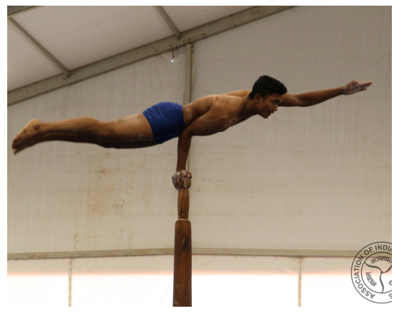
Mallakhamb 2021

1- minute and based on the number of stunts and how perfect their posture was, the results were decided. The Gondwana University, Maharashtra started the first performance in the category of 'Hanging Mallakhamb' and Mumbai University in the category of 'Pole Mallakhamb' and both the categories were for both male and female participants. This is the first time Khelo India University games is introducing a traditional sport like this.