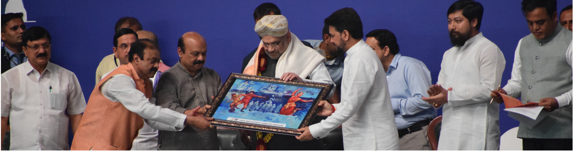
Closing Ceremony of KIUG 2021