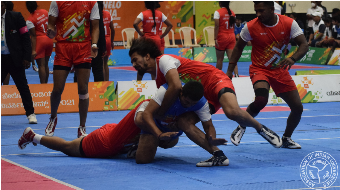
Men's Kabaddi