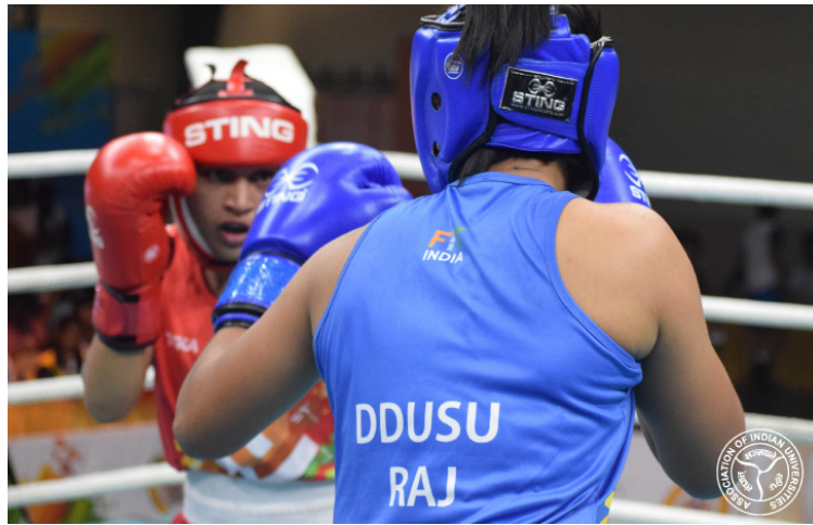
Women's Boxing