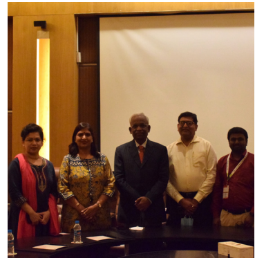
Interview with the Association of Indian Universities (AIU) Page 8