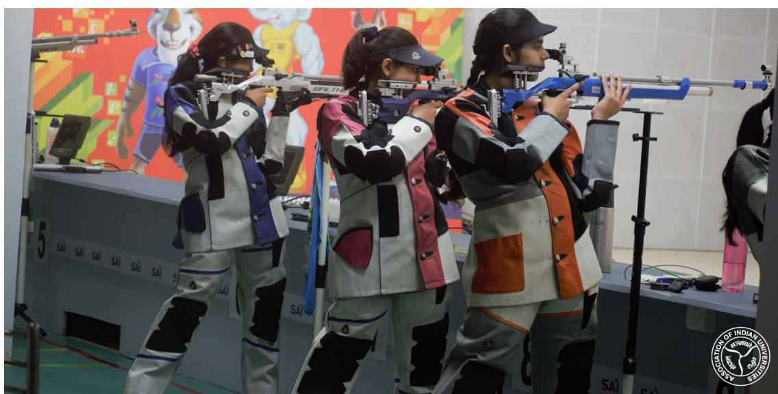
Women's Rifle Shooting