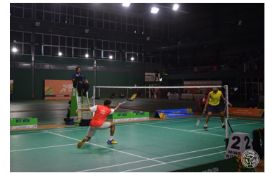
Men's Badminton Finals