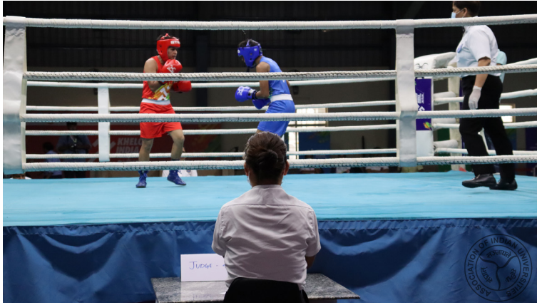
Women’s Boxing Championship KIUG 2021