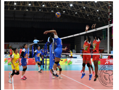
Women's Volleyball