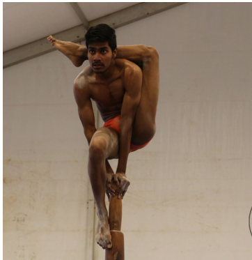
Hosted for the first time 'Mallakhamb' in KIUG 2021 Page 2