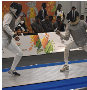
Fencing Finals of Khelo India University Games 2021 Page 10