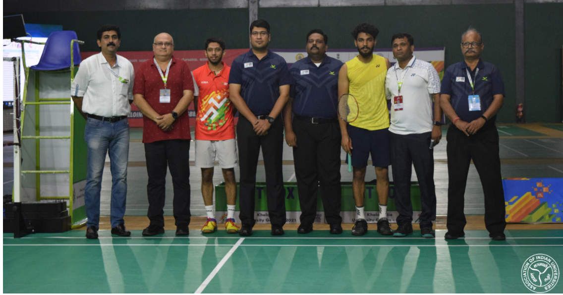
Men's Badminton Finals