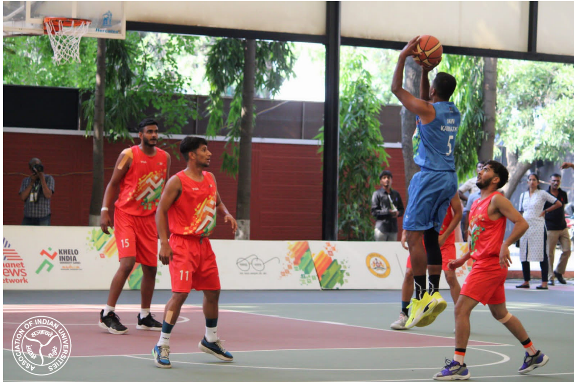
Men's Basketball 2021

Quarter 1 of girls' basketball began between the University of Mahatma